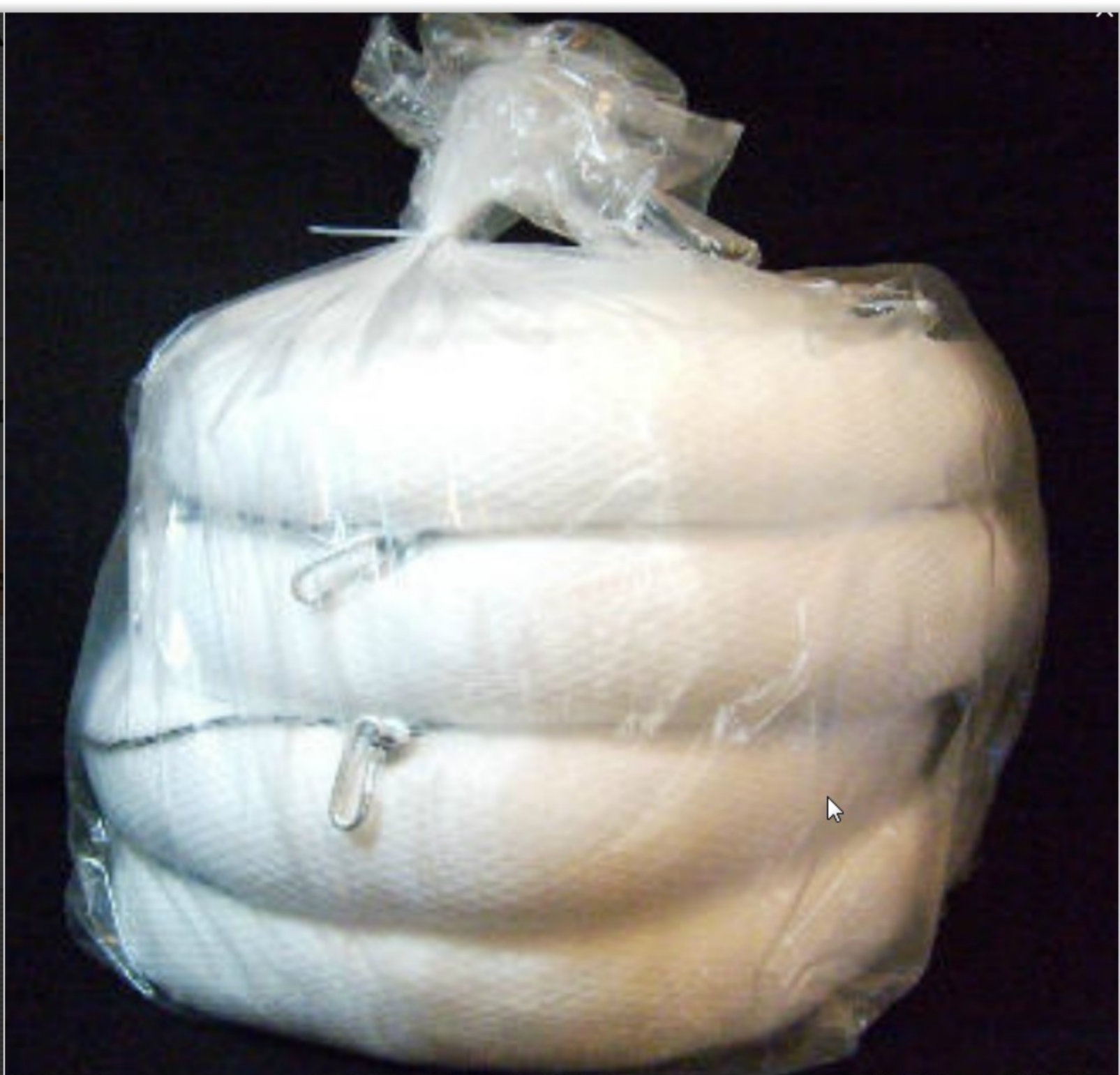
O-B-B510 5 Inch Sorbent Boom (Oil Only) Absorbency: 32 gallons/roll