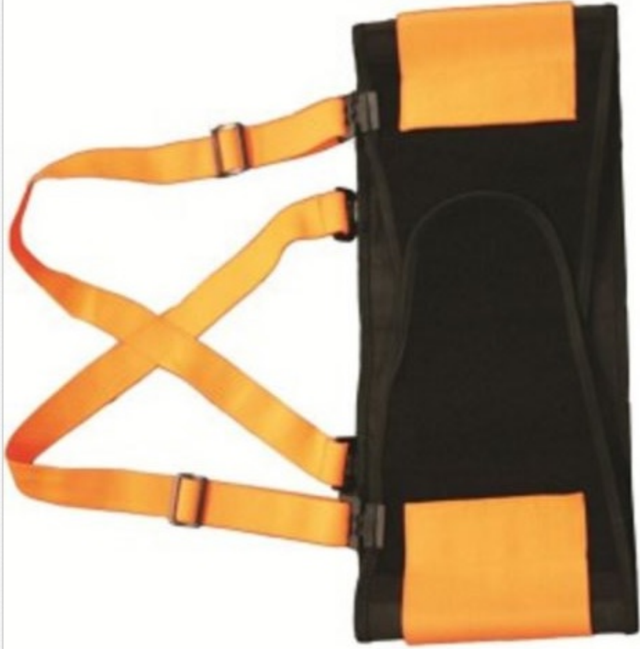
Cordova SB200 Hi-Vis Orange Back Support Belt With Attached Suspenders SIZE XL