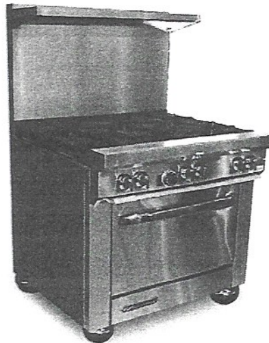
(S36D shown with optional casters)