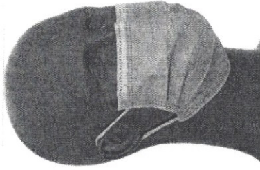
Disposable Face Mask With Ear Loops, Blue, 3-Ply, 50/Box