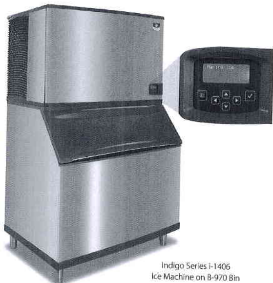
Indigo Series i-1406 Ice Machine on B-970 Bin

Designed for operators who know that ice is critical to their business, the Indigo® Series Ice machine's preventative diagnostics continually monitor itself for reliable ice production. Improvements in cleanability and programmability make your ice machine easy to own and less expensive to operate. New Levels Performance showcasing improved ice harvest along with reductions in energy consumption.