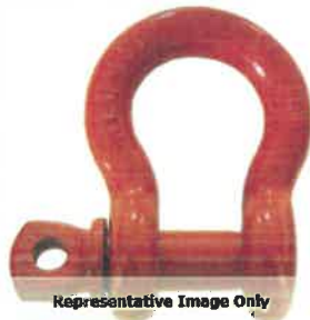
Representative Image Only